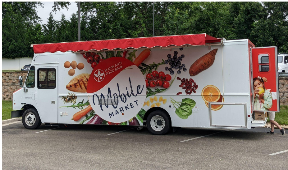
Photo: Mobile Market van in West Cecil Health Center Parking lot.